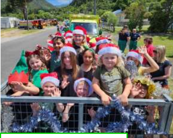
Another great Featherston Christmas Parade!