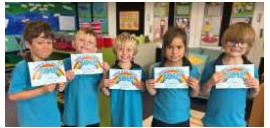
Celebrating these 5 wonderful classroom helpers who happily helped clean up their classroom!