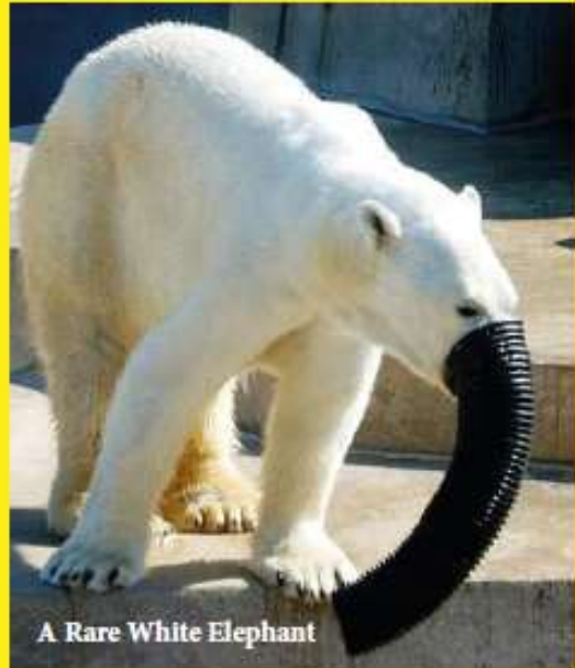
A Rare White Elephant