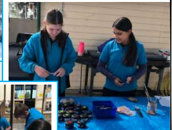
Painting a rock for our Country Fair competition!