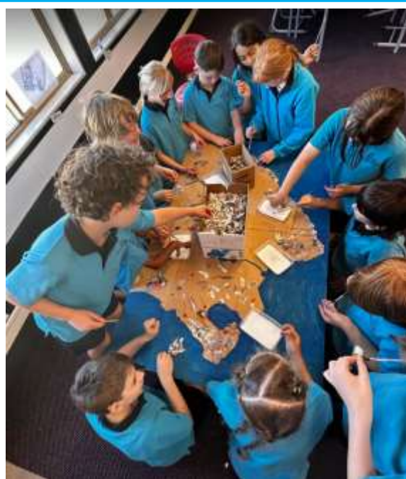
Inquiry learning, local history! Middle Room creating a map of the South Wairarapa!